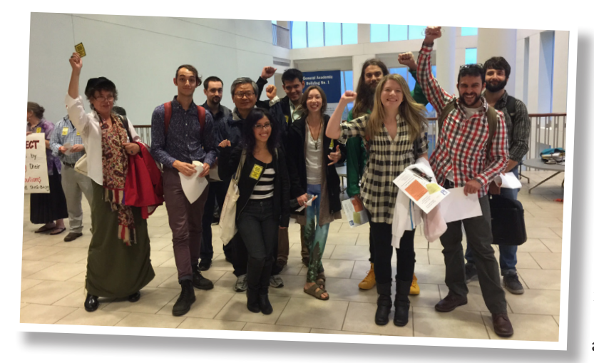
UMASS BOSTON STUDENTS SHOWED THEIR SOLIDARITY WITH FACUL-TY AND STAFF MEMBERS LAST SPRING, URGING UMASS ADMINISTRA-TORS TO HONOR THEIR AGREEMENT.

Stronger Together, continued from cover.