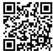
Library feedback form

News: blogs.umb.edu/library Facebook: facebook.com/HealeyLibraryUMB Twitter: twitter.com/HealeyUMB Instagram: instagram.com/healeylibraryumb Archives Instagram: instagram.com/UMBArchives LinkTree: linktr.ee/healeylibrary