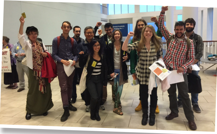
UMASS BOSTON STUDENTS SHOWED THEIR SOLIDARITY WITH FACULTY AND STAFF MEMBERS LAST SPRING, URGING UMASS ADMINISTRATORS TO HONOR THEIR AGREEMENT.

Stronger Together, continued from cover.