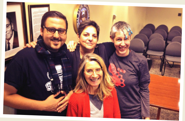
CONGRATULATIONS TO ADJUNCT FACULTY AT LESLEY UNIVERSITY. THE ADJUNCTS VOTED OVERWHELMINGLY TO FORM A UNION AND WILL BE PART OF ADJUNCT ACTION/SEIU. ADJUNCT ORGANIZING DRIVES ARE CURRENTLY UNDERWAY AT NORTHEASTERN AND BOSTON COLLEGE.

While recognizing these challenges, participants were optimistic about the value of coalition bargaining and left the meeting ready to get to work on building coalitions. ■