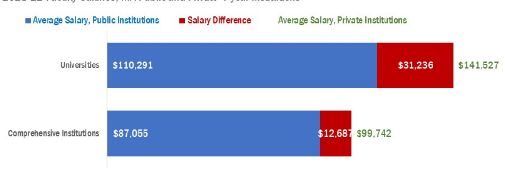
Figure 1. The Difference between Salaries for Faculty teaching in Public Institutions and Private Institutions is over $31,000 at Universities, and nearly $13,000 at Comprehensive Institutions 2021-22 Faculty Salaries, MA Public and Private 4-year Institutions

On average, faculty teaching at UMass earned about $31,000 less than faculty teaching at private, independent research universities (Figure 1). The difference is about $13,000 for faculty teaching at public state comprehensive universities compared with those teaching at private institutions. By faculty rank, with only one exception, the result is the same and faculty teaching in public 4-year institutions earned less than those in the private sector. The difference is most striking for full professors at UMass who earned nearly $34,000 less than those in private research universities.