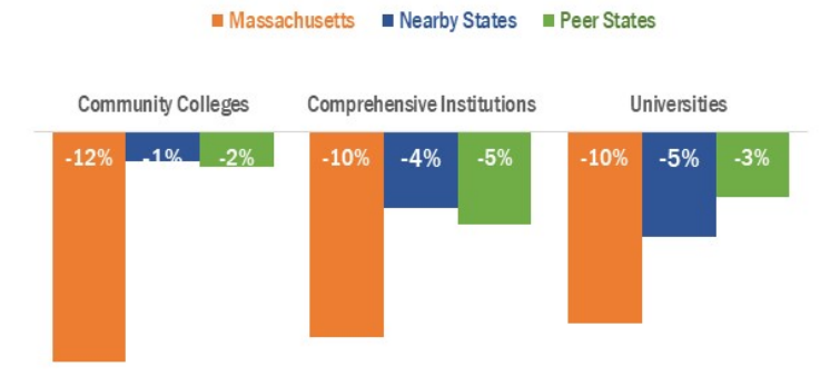
Figure 6. MA Faculty Inflation-Adjusted Salaries Declined Sharply Compared to Nearby and Peer States Change in Faculty Salaries in Constant Dollars, 2016-17 to 2021-22

were compared to the Massachusetts Institute of Technology (MIT) living wage estimates. MIT developed these estimates for counties and states based on "the local wage rate that a full-time worker